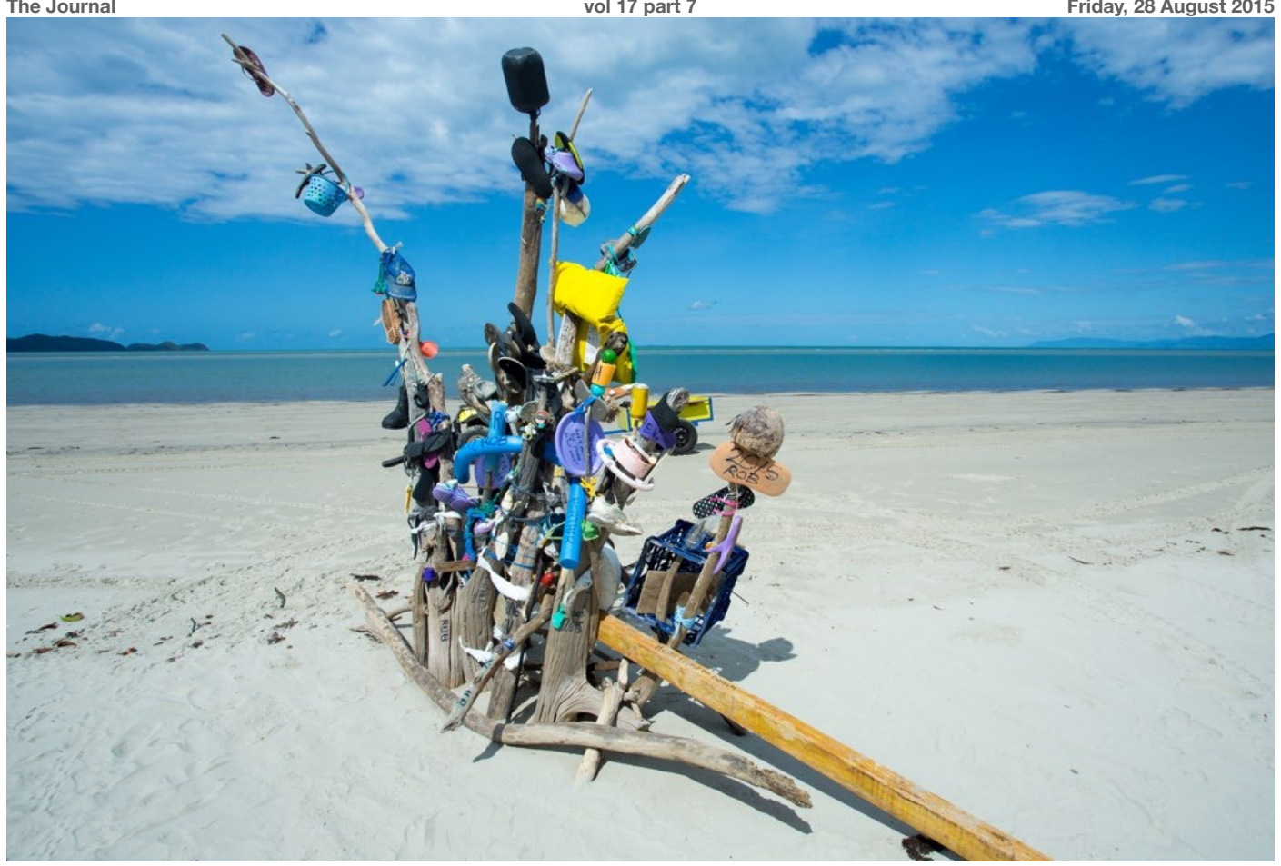
My neighbours Heather and Rob build his each year from stuff washed up on the beach. Then some mangroves next to a small fresh water creek.