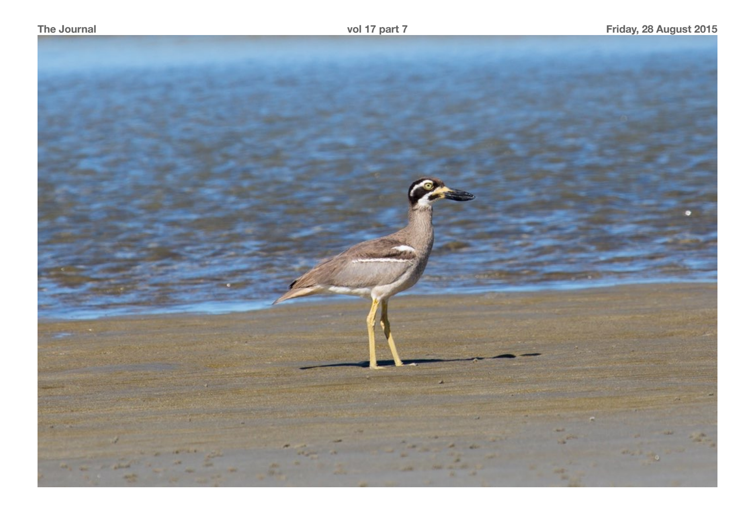
A beach Curlew and some fig Parrots.